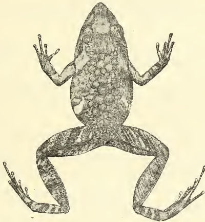
Text Fig. 5.— Mantidactylus glandulosus , sp. nov. Dorsal aspect.

The tibio-tarsal joint of the adpressed hind limb reaches as far as the anterior corner of the eye.